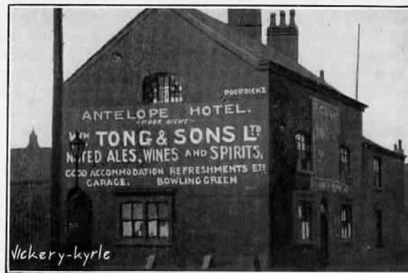
"Poor Dick's" (Antelope Hotel).

15, 17, 58, 60 & 62 MANCHESTER ROAD, WEST. LITTLE HULTON.