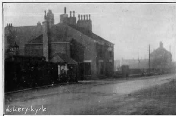
The Council Offices, and in the background on left, Peel School.

The climate is decidedly healthy and the death-rate low. The vital statistics show a favourable position for longevity and good general health. Although the climate of South East Lancashire is generally regarded as damp and unattractive, the fact that the town is a strip town fronting the sides of the three great main roads and open to all the breezes that blow, makes the air bracing and tonic and particularly along Manchester Road, which runs with the prevailing westerly winds for almost the whole of its length. The nearest point of the sea is probably within thirty miles. The atmosphere is fairly smoke free, most of the congested manufacturing centres being some miles distant.