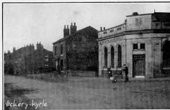
Manchester and County Bank, Clegg's Lane Corner.

For a manufacturing and industrial township, Little Hulton is exceptionally well provided with recreational centres. The Little Hulton Cricket Club has had a long and continuous existence and continues to flourish and to command a large share of the patronage of the residents. It has a fine elevated ground fully