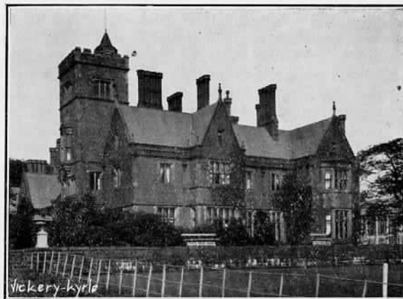
Peel Hall Pulmonary Hospital, formerly Yates Peel Hall and New Peel Hall.

Yates Peel Hall is a brick and stone edifice with two wings and a castellated north side. A cornice in the Entrance Hall bears the arms of the Yates family (a crest and a stag's head). The Hall was given to the