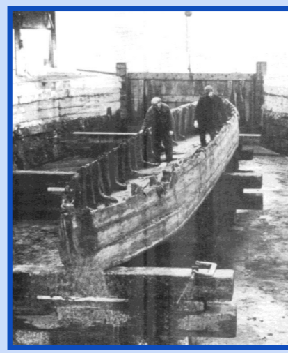
© Maps and images courtesy of Glen Atkinson and Alan Davies